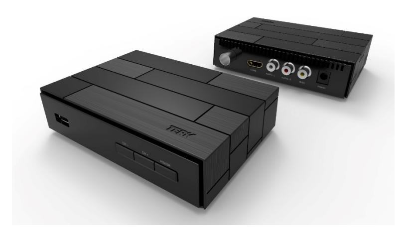
The TERK HD Digital TV Tuner with recording functionality (MSRP $49.99) is the brand's latest in HD digital TV turner technology, now featuring recording capabilities. Simply attach an antenna to the tuner and connect to any television, digital home theater display, or projector to enjoy free local HD channels and record live HDTV. The HD Digital TV Tuner with recording

TERK has reimagined the shape and look of a traditional antenna with their new OMNI (MSRP $59.99). Its unique shape and design allow it to easily integrate into your home entertainment setup, instead of being relegated to hiding behind your TV. The cylindrical shape is a nod to its ability to function as an amplified, multi-directional HDTV antenna. The OMNI makes it possible to enjoy top-rated HDTV network programming and favorite shows for free – no monthly fee, no subscription and no contract. TERK's proprietary dual stage amplifier technology, DUALBOOST, provides more HD channels along with the best picture and sound possible. DUALBOOST outperforms all other competitors' amplifier technology by boosting the signal at the antenna, while also boosting the signal at your TV – made better by the OMNI's 360-degree reception. Accessories included with the OMNI are an extended 10' coax cable, power adapter and removable amplifier for maximum flexibility and performance.