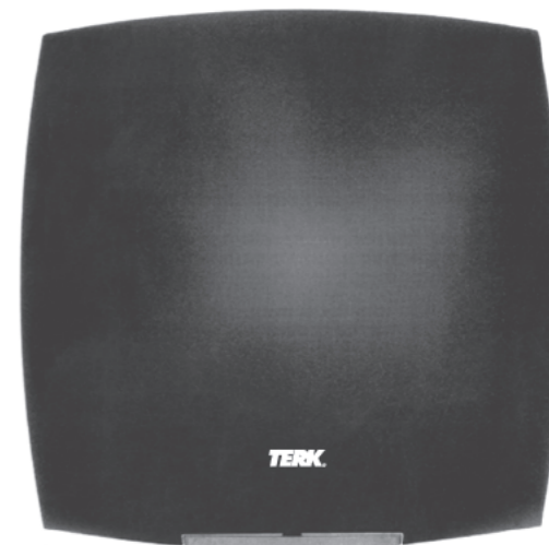
FM+ FM Indoor Antenna